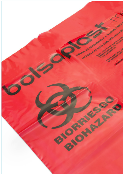
Biohazard logo printed and instructions for use