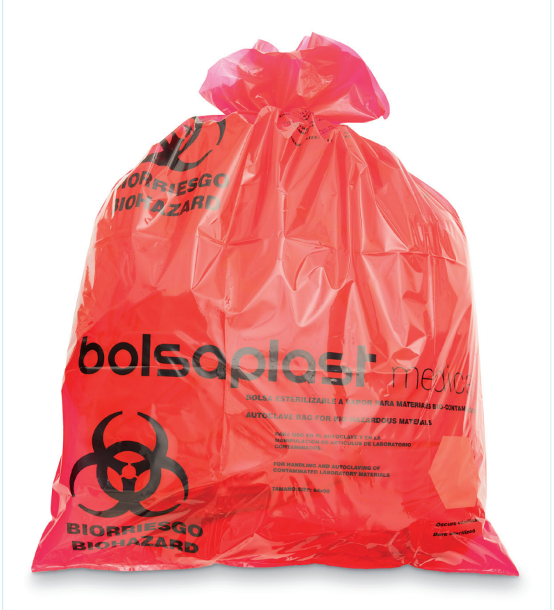
Excellent quality bag, easy visibility of printed text and STEAM indicator. In red colour, for risk identification